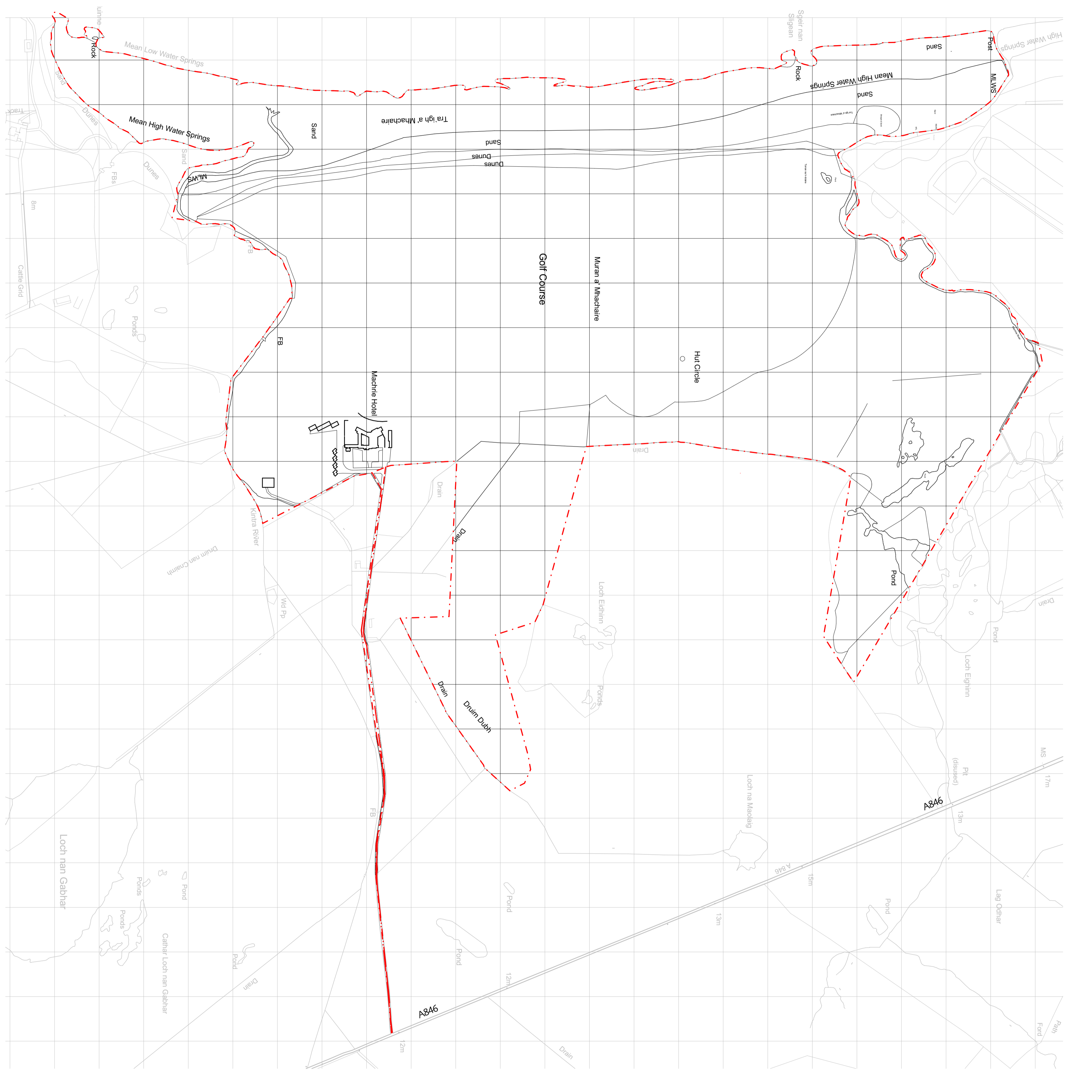
SITE LOCATION PLAN (ORDNANCE SURVEY) 1:5000* NOTE: DUE TO THE SIZE OF THE SITE, THE SITE LOCATION PLAN IS SHOWN AT 1:5000 ORDNANCE SURVEY GRID REFERENCE - NR3249